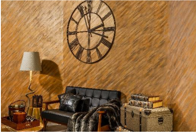
7 - Momento Rust Box