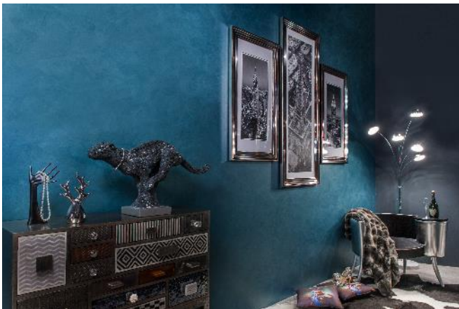
9 - Momento Velvet Pearl