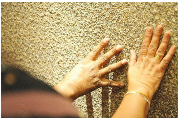
3 - Nippon Memento Stone Art provides a unique 3D finishing similar to actual surfaces such as granite