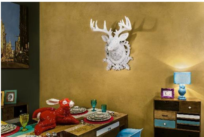
6 - Momento Velvet Metallic