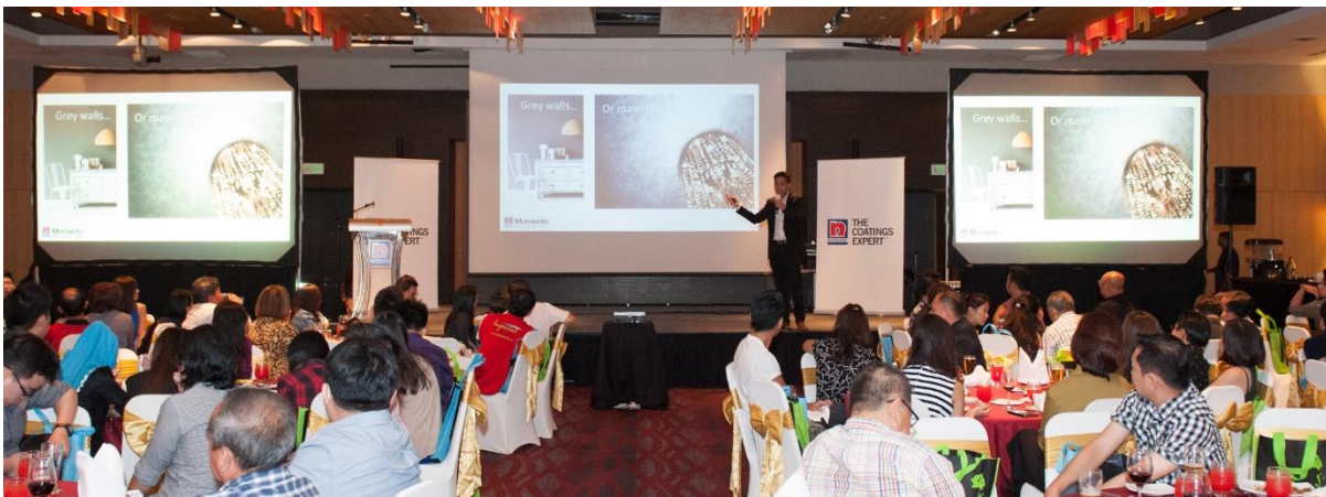
5 - Over 300 customers, dealers, interior designers, architects and other stakeholders were present at the launch, held at G Hotel Gurney