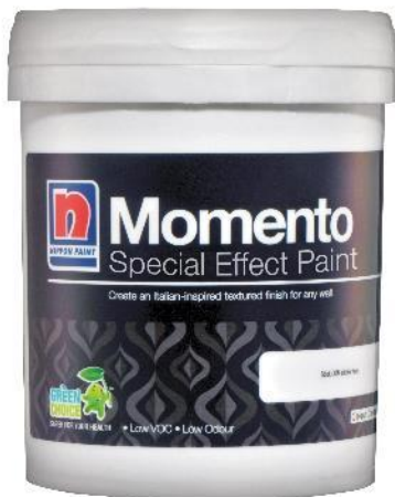
2 - Memento Special Effect Paint