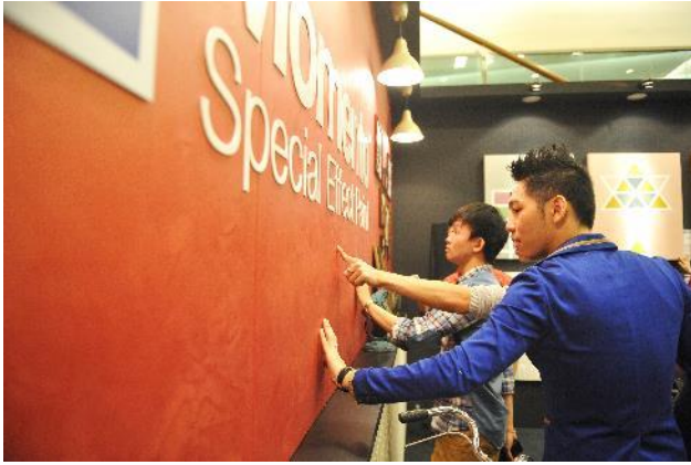
4 - Nippon Momento Velvet Series provide a smooth texture look that adds an exceptional touch of luxury to the surface